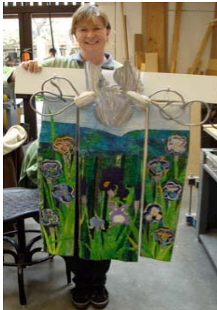
Iris Quilt Hanger